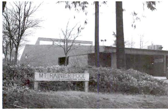
Mt. Rainier swimming pool will remain open in 2003

Meanwhile, the cities and school district continue to look for ways to keep the pool open beyond 2003. A report and recommendations for a long-term solution will be presented to each city council and the school board by August 15, 2003.