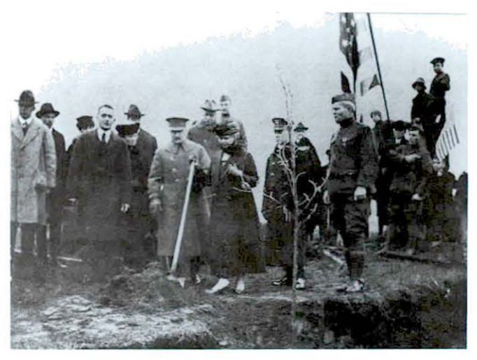
Elms are planted to honor WWI veterans.

During the upcoming months, public meetings, fliers, posters, and an updated traveling exhibit about the corridor